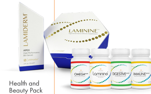
Health and Beauty Pack

5 IBO enrollments × 200 points = 1,000 points